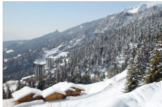
Picture: A top location for the ultimate break

The first bricks are in place as ALP work with a UK group investing in a commercial luxury chalet business planned for Crans Montana. The development is situated at 1650 metres, with ski to the door access and with 270 degree panoramic views. Operational for the 2006/2007 season, it is expected to be a big hit for high end holidays and corporate entertainment.