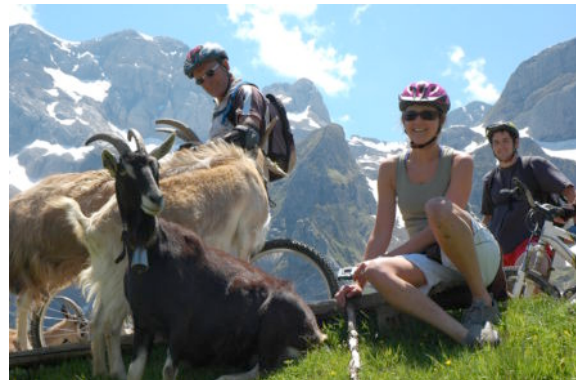
Picture: Unwind with the locals in the Portes du Soleil

For further information: www.miggins.net , info@miggins.net or +33 6 27 12 86 99