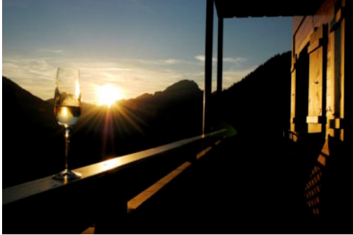
Picture: Long summer evenings in the Alps

The newsletter for investment partners and potential partners