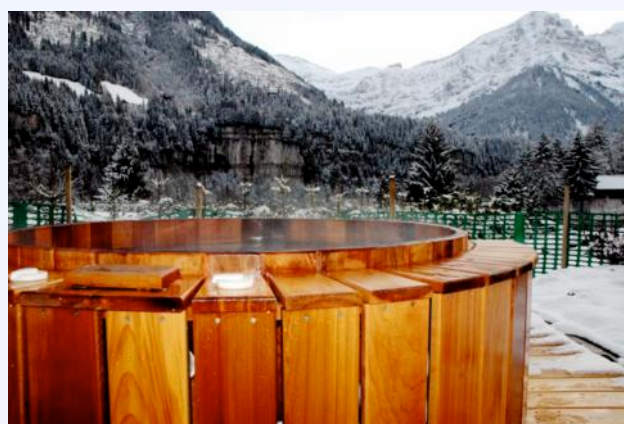
Steaming hot tubs in the snow will welcome many Lodge guests

Purchasers at The Lodge are all set to receive their (electronic) keys, for what is forecast to be an excellent ski season.