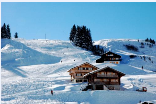
Great early season conditions in Les Crosets

There has been much written about the moratoire in the Swiss canton of Valais during the past months (refer StyleLife! 12). The moratoire, was set up to cut the waiting lists in administration for foreign purchasers in the canton (six years for a permit in some locations), meaning that a number of communes were forced to suspend foreign sales.