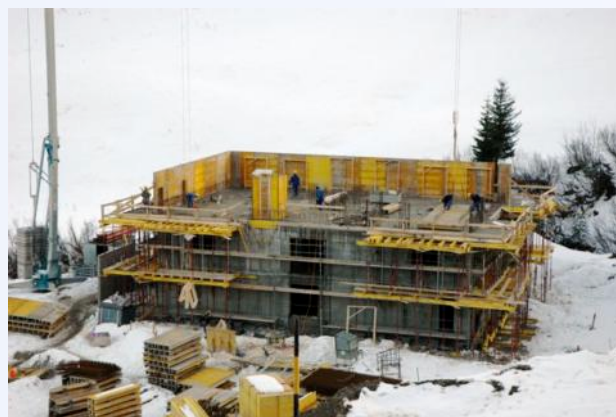
Building already in progress for the new Crosets hotel

StyleLife! will be updating readers on the development during 2008, but for anyone wishing to make advance reservations, contact info@alpinetracks.com .