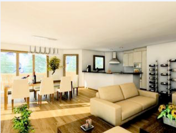
The Lodge - luxury vacations with Mrs Miggins Services

Purchasers at The Lodge are able to relax in the knowledge that their investment is already set for the luxury ski rental market with a strong demand for 2007/2008 winter season.