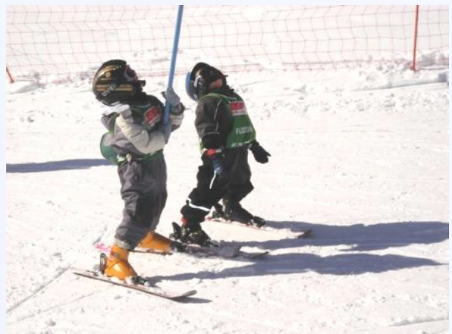
Jack Frosts will take care of the Lodge guests' children

Contact info@miggins.ch for further information or reservations miggins.ch for reservations.