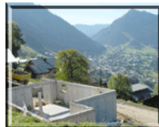
New chalet will have stunning views

Investors will get a feel for the region, the potential for investment and see at first hand what the largest ski