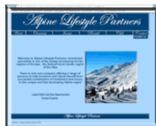
ALP on line

Alpine Lifestyle Partners are now live on the web, with their new web site including information about ALP and ALP products.