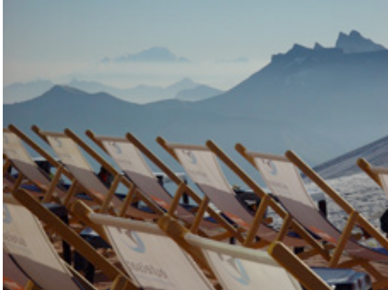
ALP photo recently used for a BBC news story